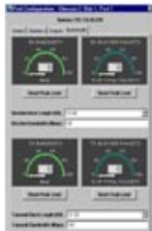
NetBeacon™ bandwidth usage